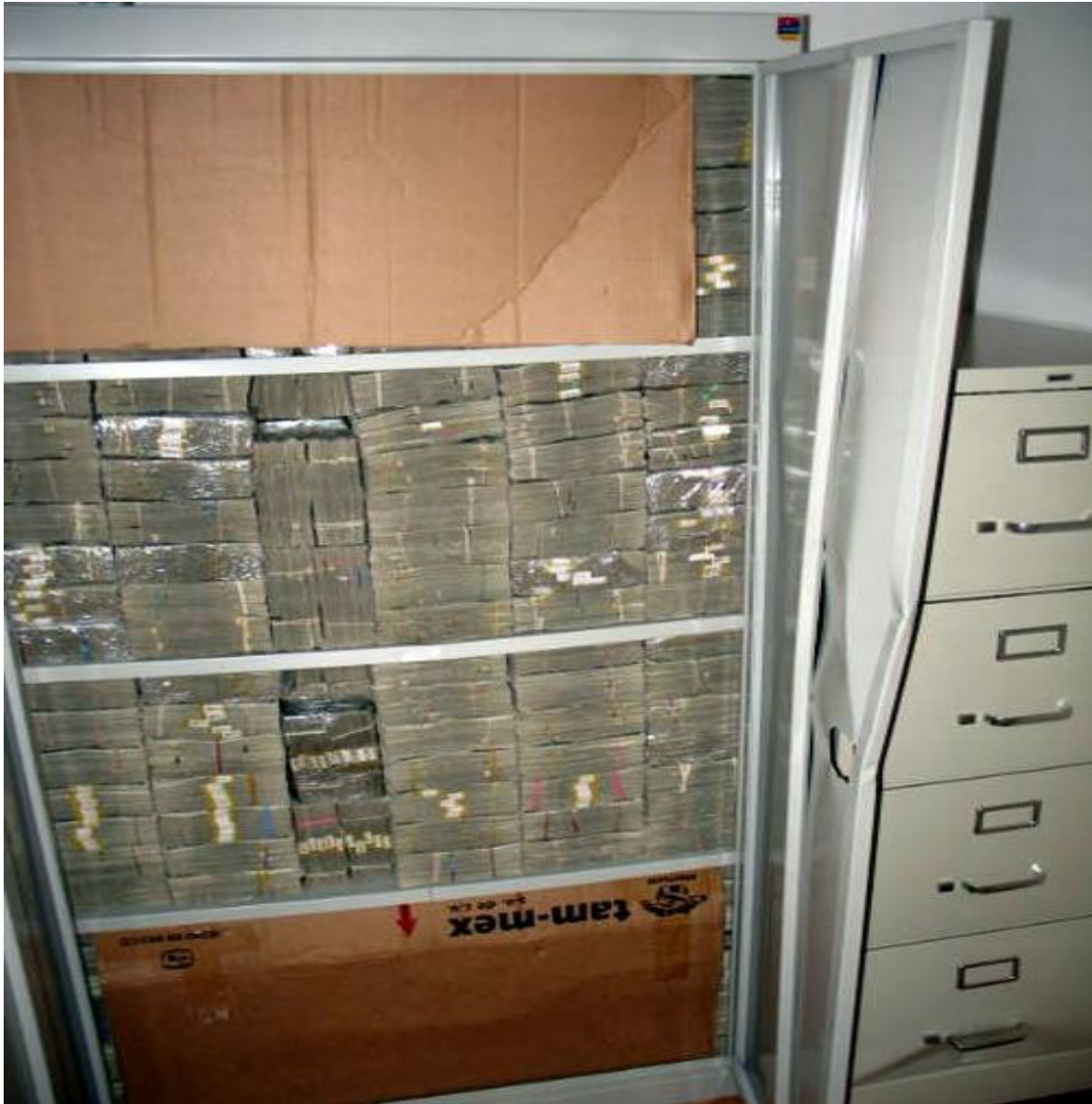
Stacks of cash were found in every nook and cranny.