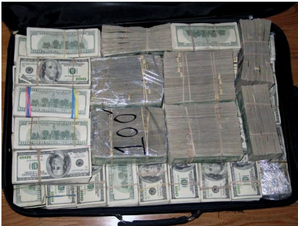
This case filled with 100 dollar Bills, no doubt headed out to make another drug buy, perhaps from the Colombians.