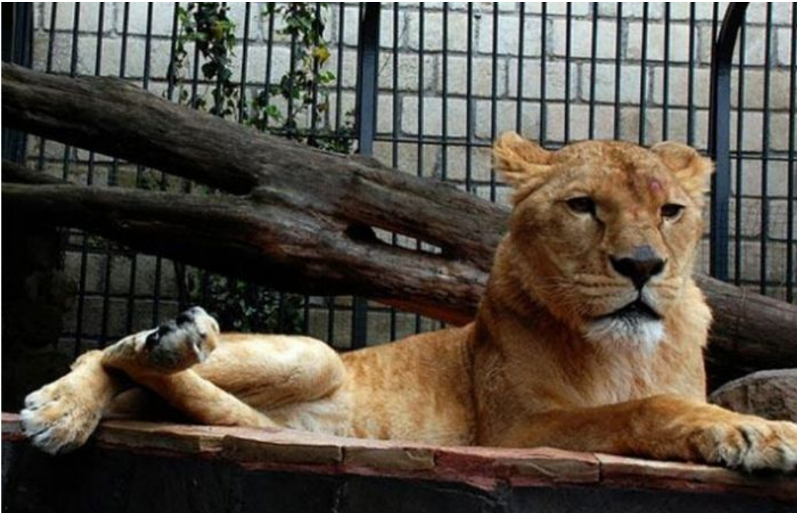
8 Lions were on the property