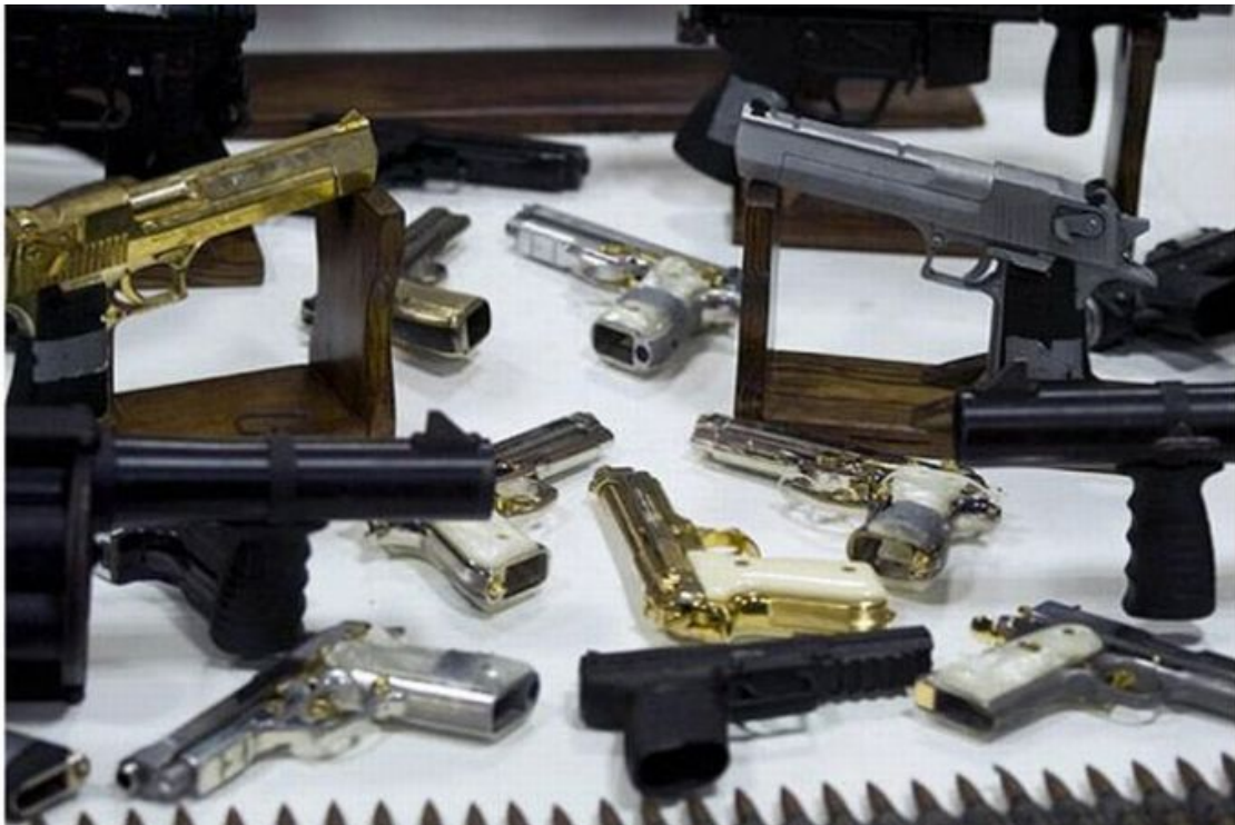
More guns than you could ever imagine!