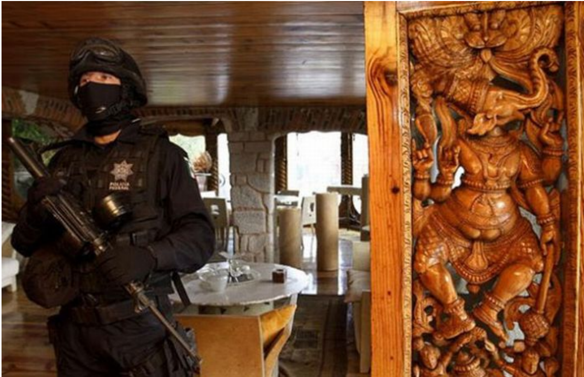
Exotic art collection - some of which was illegal to own - some stolen