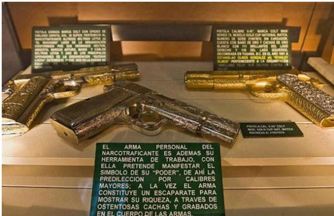
Gold-plated collector's guns.