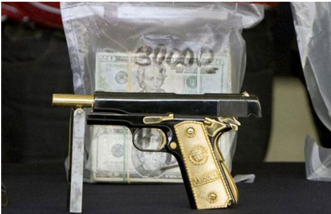
357 Magnum semi automatic with solid gold grips.

Go and kill in the name of the Lord my son! There was a matched pair of these found.