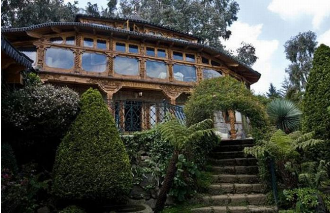
Just a quaint little villa in the hills - Drug money bought it all!