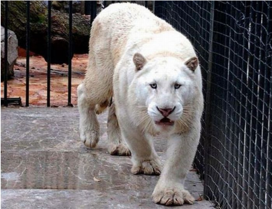
A very rare White Tiger