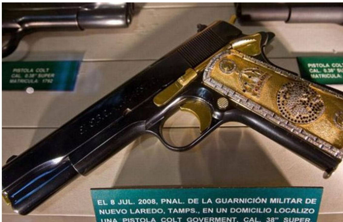
Gold and Titanium 45 Caliber semi automatic pistols - they found 16 like this