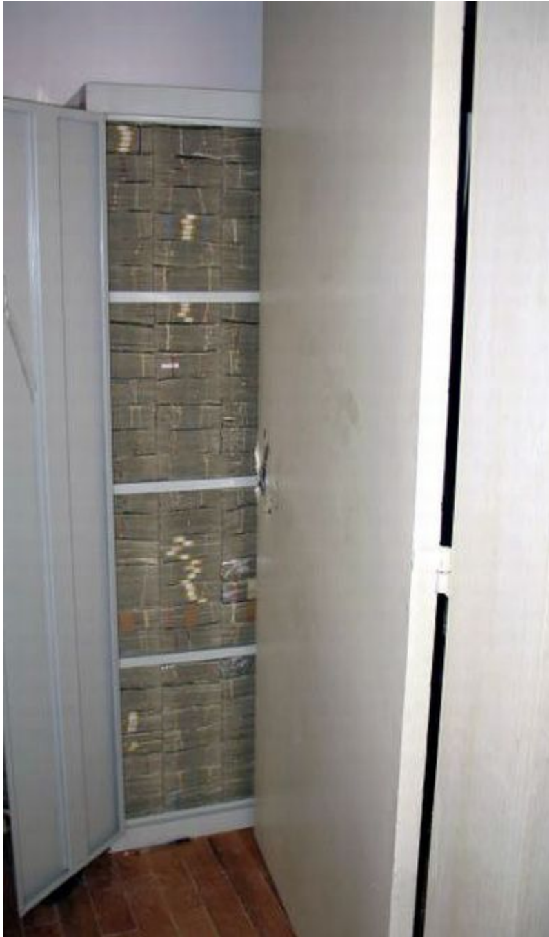
Another cabinet stack tight with cash - all 100's.