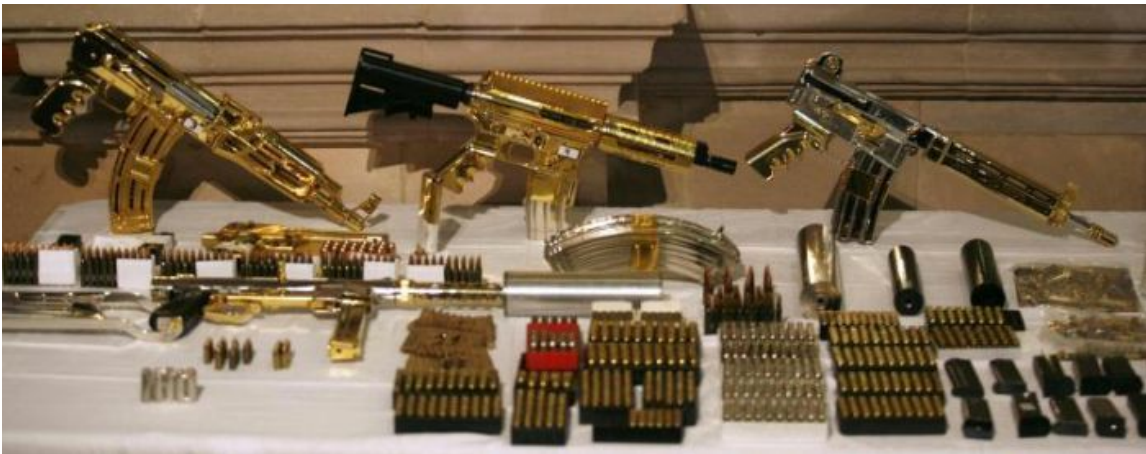
More Gold machine guns and pistols - most were never fired, just held for collection value.