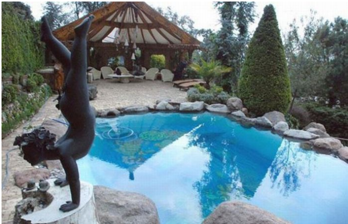
The back yard pool