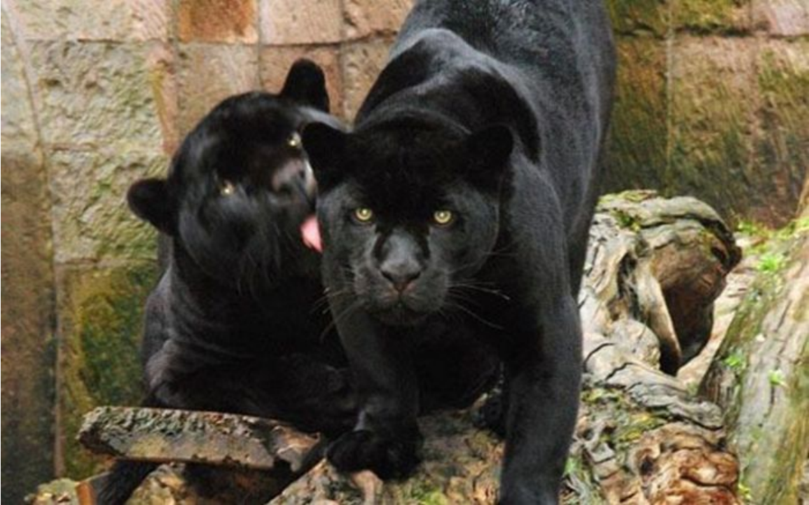
A collection of exotic animals, cared for in the grandest fashion