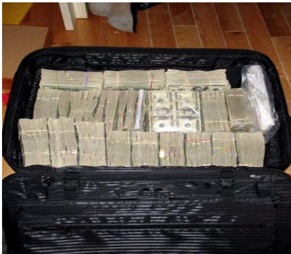
18 plastic bins filled with 100 dollar bills were found...