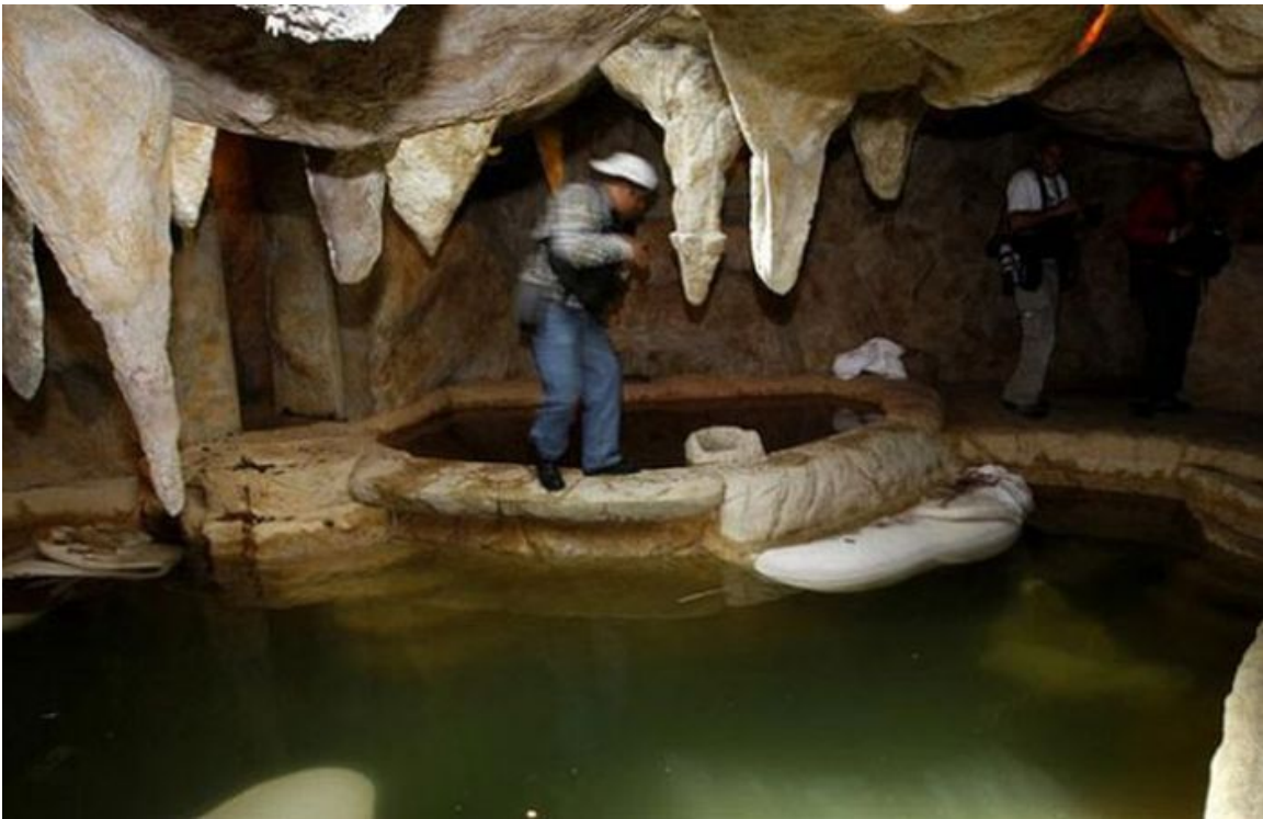
Man made cave and hot tub inside the home