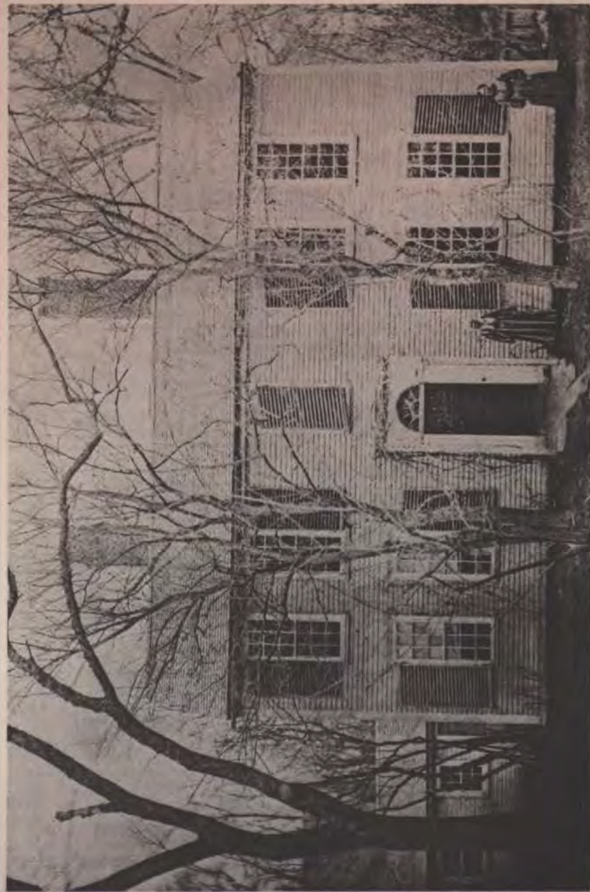
HOUSE OF THE REV. SAMUEL COOKE. 1740—1871.