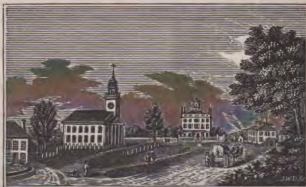
CENTRE OF WEST CAMBRIDGE IN 1817.