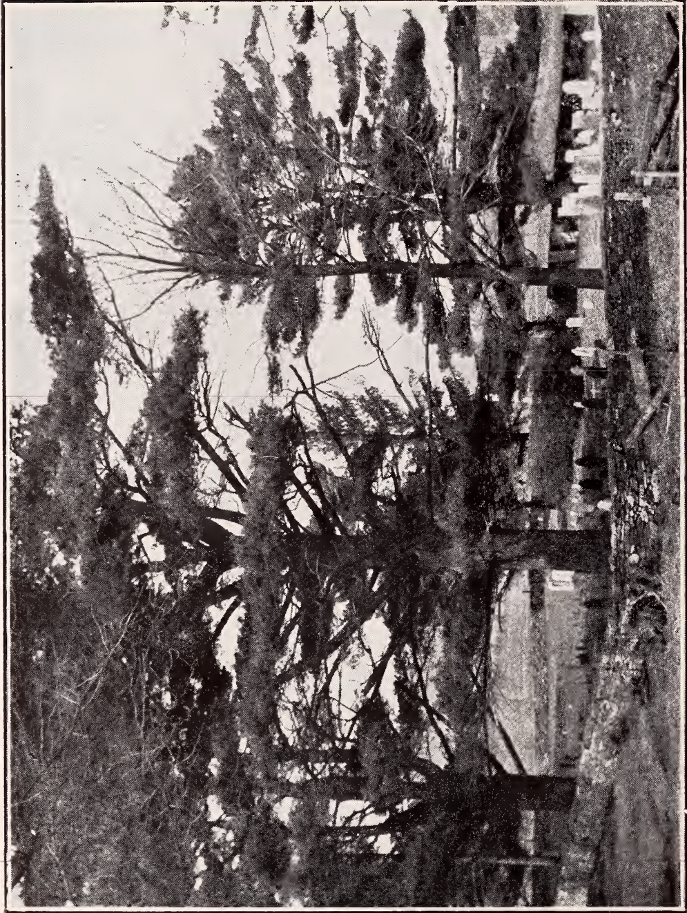
The Burying Ground at "The Square"