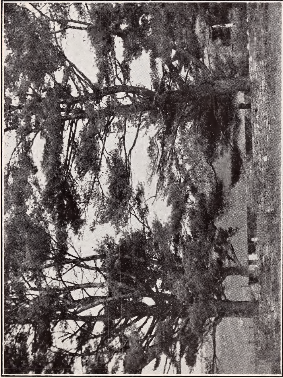
The Burying Ground at "The Square"