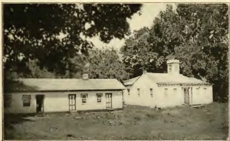
Clermont Academy, and Bock Row, in which roomed students from a distance.