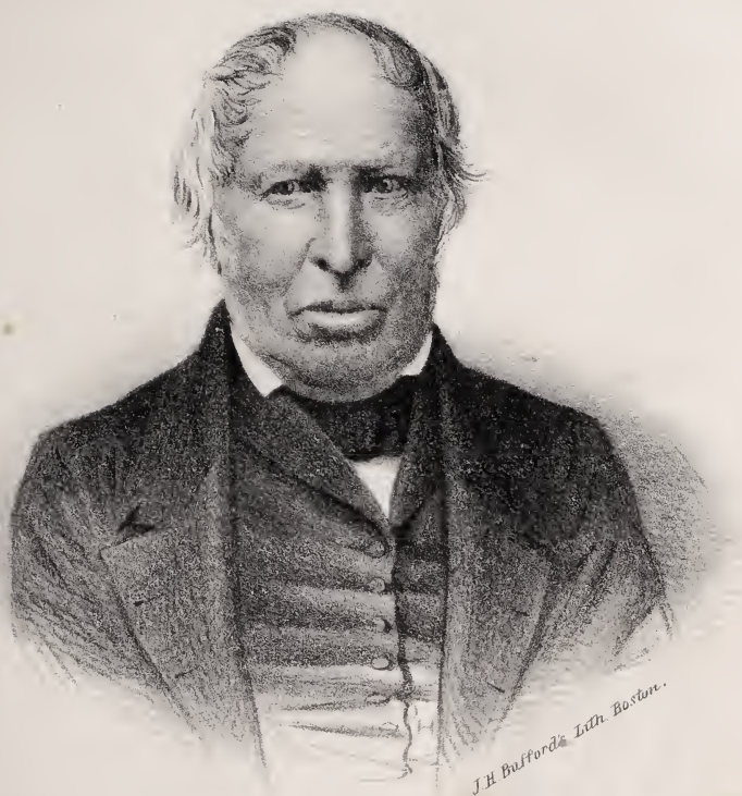
HON. ELIHU CUTLER.