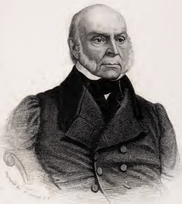
John Quincy Adams.

Engraving of the original taken from life.