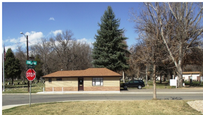
Mountain View Cemetery Office