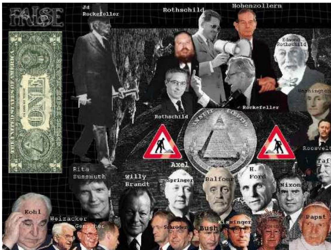
The Dark Illuminati World Banking Organization - A Recent Generation