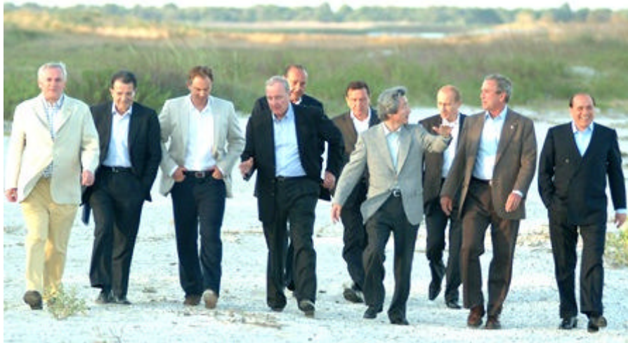
The Devil's Pimps and Propaganda Pumps

" We're an empire now, and when we act, we create our own reality. And while you're studying that reality -- judiciously, as you will -- we'll act again, creating other new realities, which you can study too, and that's how things will sort out. We're history's actors. . . and you, all of you, will be left to just study what we do. " - A statement of a Bush administration senior advisor