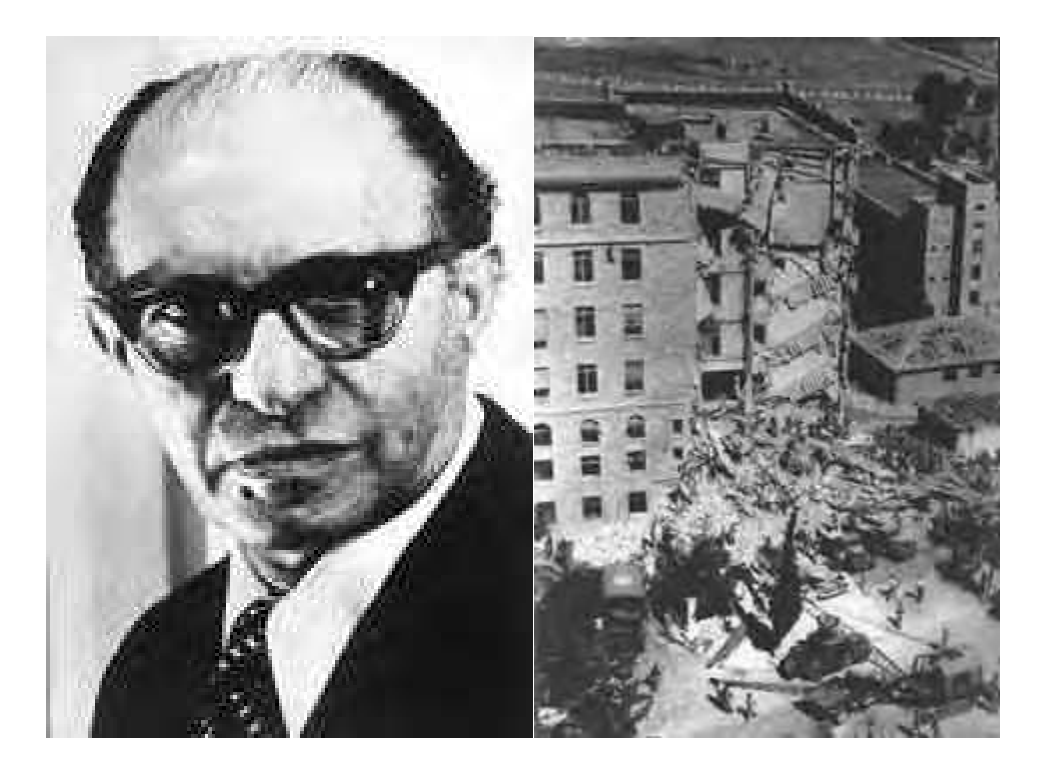
LEFT: TERRORIST TURNED PRIME MINISTER MENACHEM BEGIN. RIGHT: RUINS OF KING DAVID HOTEL.