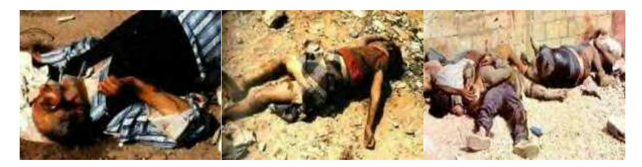
SOME OF ARIEL SHARON'S PALESTINIAN VICTIMS